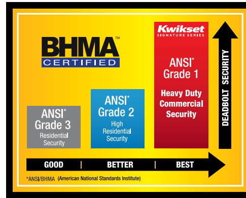
* 980 Deadbolt

Protects against lock bumping**. Not only is a SmartKey deadbolt the most convenient residential deadbolt you can buy, it provides the security you need.